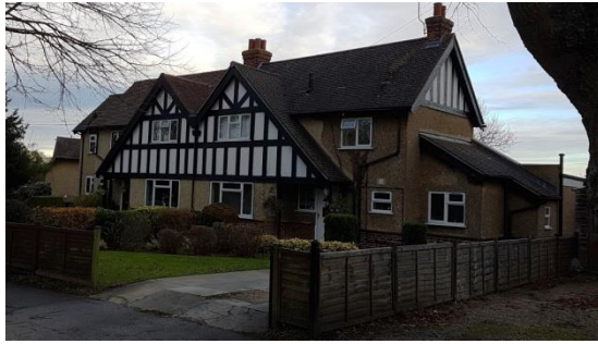
Figure 2.2 “Tudorbethan” style house in The Avenue