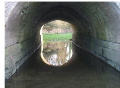
Figure 2.1 Wheatley Bridge, the remaining pointed arch of the medieval bridge can still be seen inside the reconstruction of 1809

The Thame river has been a moat and its bridge a barricade, at least twice. In 1642, Wheatley medieval bridge was provisionally agreed as a boundary point between the King in his Oxford capital and Parliament in London. One arch was cut, replaced by a drawbridge and the area heavily patrolled. The guard quartered on Wheatley. In 1940, during the Invasion Alert, the Bridge, part of the London-Birmingham road, was again guarded and blocked.