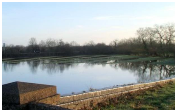
Figure 2.4 View of ridge and furrow from Wheatley Bridge looking south

2.5 There has been continuous habitation in the area since Roman times as overlapping Roman and Saxon estates with related burials attest. Stone and Iron Age settlements left their traces too. By the 10 th century, Wheatley had long been part of a royal Saxon estate centred on Cuddesdon. [5, 6, 7]. King Edwy gave it to the Abingdon Benedictine Abbey which remained the local landlord for almost 600 years. Cuddesdon parish and its Wheatley chapelry grew up in that period and a thousand years of ridge-and-furrow management still shows clearly in Wheatley's meadow land.