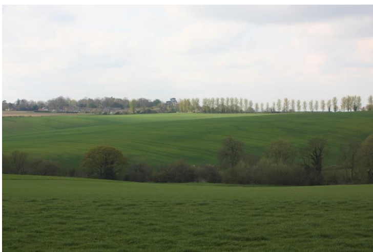
Figure 1.4 Cuddesdon on the Hill

2.8 Wheatley was never a market town. It became a parish only in 1856. Just one owner-resident family, the Archdales, lived at the Manor House (1568 – 1648), long before the Hassalls settled in 1939 for sixty years. Lord Camoys, one of the three generals at Agincourt (1415) and the House's best known owner, recruited here, but never resided. The Archdales embellished it as their wider family grew wealthy in London and in the Ulster Plantation. After the Elizabethan religious settlement, the Archdales, the Bromes of Holton (and the Cursons of Waterperry) were noted for recusancy and for harbouring outlawed priests. St. Mary's church was completed in 1856, the spire being added twelve years afterwards, and with a new village designation of Wheatley Urban District (1894) Wheatley eventually grew out of its Cuddesdon shadow.