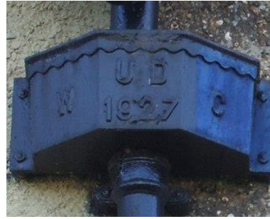
Figure 2.3 Hopper used for WUDC houses

2.3 London Road rises from its 'Cut' to Park Hill, passing the King's Arms fork where Church Road commenced the medieval route to Oxford, later turnpiked in 1719, over Shotover Hill. Upper London Rd took on the turnpike in 1789 paving a way to Oxford through Shotover Valley, which is now the A40. On Park Hill, Holloway Road crosses from Holton down the steep northern side of Wheatley valley. It is Wheatley's only north-south road. Old London Road, London Road, Crown Road, High Street and Church Road, not to mention the A40 and the M40, run E-W, all with eyes ultimately on London thereby shaping the linear village. Holloway Road connected the two ancient parishes of Holton and Cuddesdon long before Wheatley became a parish. At the bottom of the Wheatley valley, just where Air Quality is measured, Holloway Road crosses the High Street to climb the south side of the valley via Station Road and Ladder Hill along the old coffin-road past Coombe Wood to Cuddesdon, the former mother parish.