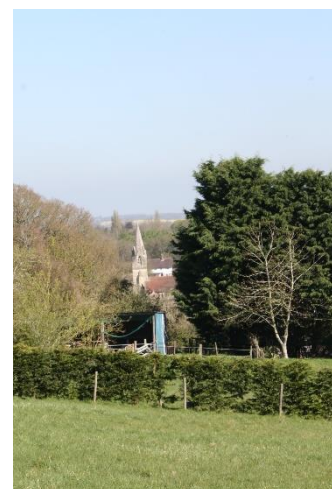
Figure 2.5 Wheatley in the Valley